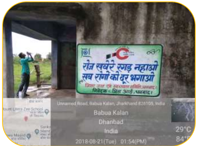
Unnamed Road, Babua Kalan, Jharkhand 828105, India Babua Kalan Dhanbad India 29°C 84°F 2018-08-21(Tue) 01:54(PM)