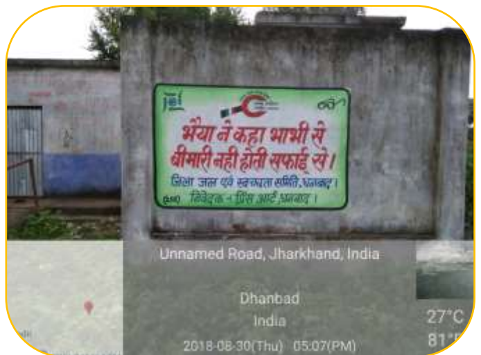
Unnamed Road, Jharkhand, India Dhanbad India 27°C 81°F 2018-08-30(Thu) 05:07(PM)