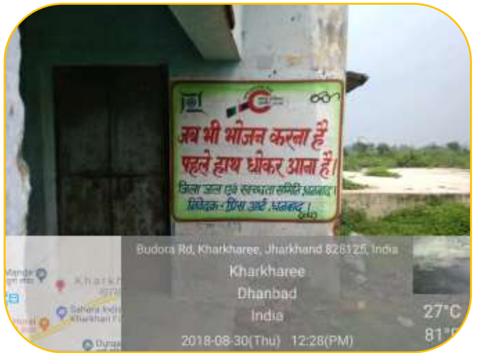
Budora Rd, Kharkharae, Jharkhand 828125, India Kharkharae Dhanbad India 27°C 81°F 2018-08-30(Thu) 12:28(PM)